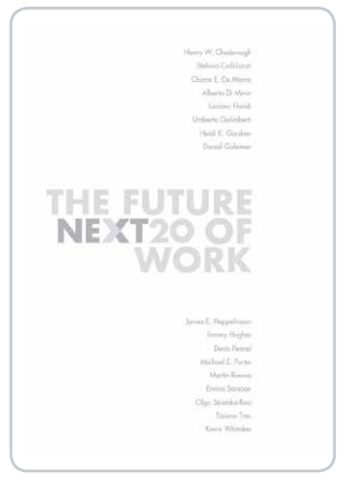
"Next 20: the future of work", a book member Gi Group's 20th anniversary.