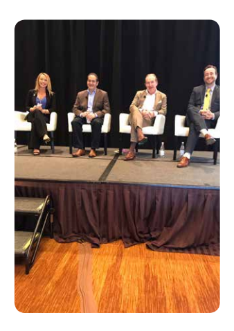
WEC Managing (3rd from left), in a panel at SIA Gig

Partnering with prominent media in the HR industry such as Staffing Latina America, Recruitment International and Global Recruiter, WEC regularly publishes opinion pieces about the evolution of labour markets and the changes affecting the world of work